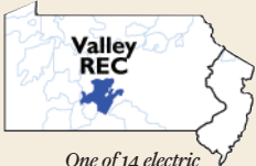
One of 14 electric cooperatives serving Pennsylvania and New Jersey

Valley Rural Electric Cooperative, Inc. 10700 Fairgrounds Road P.O. Box 477 Huntingdon, PA 16652-0477 814/643-2650 1-800-432-0680 www.valleyrec.com