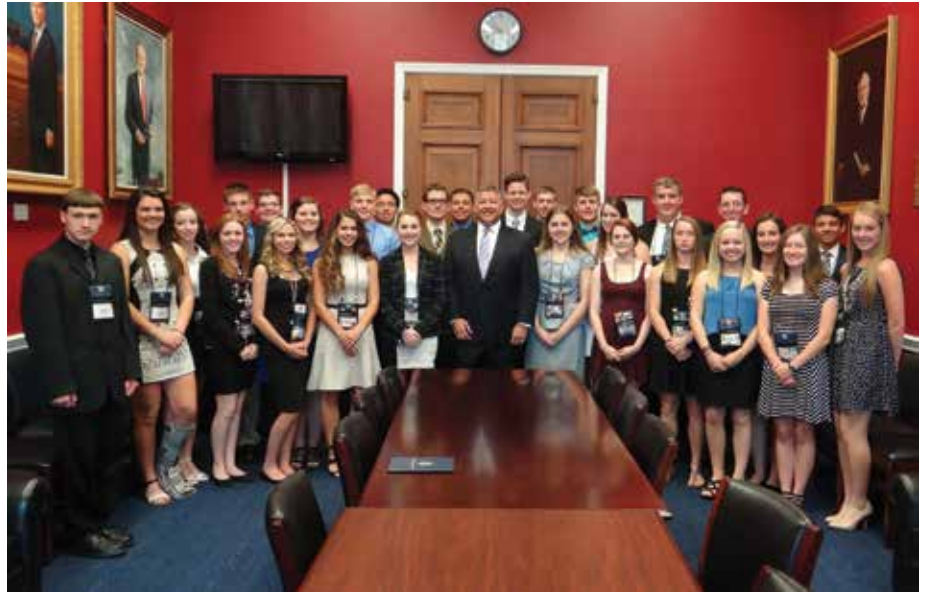
MEET YOUR CONGRESSMAN: U.S. Rep. Bill Shuster (R-9th), center, speaks to 2016 Youth Tour students. In addition to meeting congressional representatives, students learn about the cooperative business model, explore museums and monuments, and take a Potomac River cruise.

For more details, visit www.valleyrec.com and click on the Programs and Services tab and scroll down the page. Or call the co-op's member services department at 800-432-0680, extension 1663.