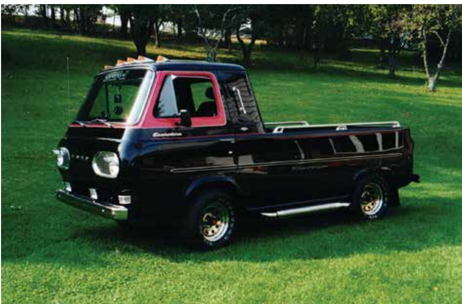
“LIL HUFF”: Sam Shade’s 1961 Ford Econoline pickup, purchased in 1983, sits in mint condition after over a year’s worth of modifications.

It took a few moments for that comment to set in. It made me realize just how much times have changed since the 1950s and 1960s. After doing some additional research, I found out that $3,000 in 1960 is roughly the equivalent of $25,000 in today’s standards.