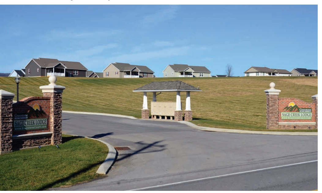
ENTER HERE: The entrance to the over-55 community is along Route 45, near Spruce Creek in Huntingdon County.