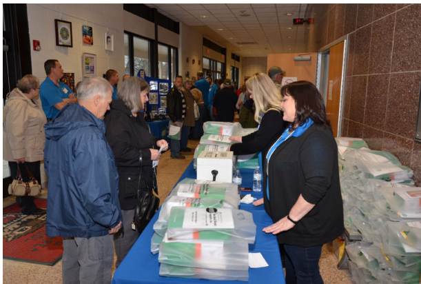
Valley Rural Electric Cooperative members arrive at Huntingdon Area High School April 5, 2019 to participate in the co-op’s annual meeting. Valley REC leaders have decided to cancel the 2020 event due to the coronavirus pandemic.

Valley Rural Electric is a member-owned cooperative providing electric service to more than 22,000 consumers in eight counties of south-central Pennsylvania, including Bedford, Blair, Centre, Franklin, Fulton, Huntingdon, Juniata and Mifflin. The co-op was incorporated Nov. 1, 1938 and energized its first lines a year later.