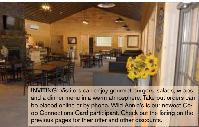
INVITING: Visitors can enjoy gourmet burgers, salads, wraps and a dinner menu in a warm atmosphere. Take-out orders can be placed online or by phone. Wild Annie’s is our newest Co-op Connections Card participant. Check out the listing on the previous pages for their offer and other discounts.

Wild Annie’s is located on Lowry Drive, behind All Things Automotive, just north of the Route 30/Route 522 intersection. The restaurant can be reached by phone for takeout orders at 717-485-0847 or by email at wildanniesfood@gmail.com. 🌞